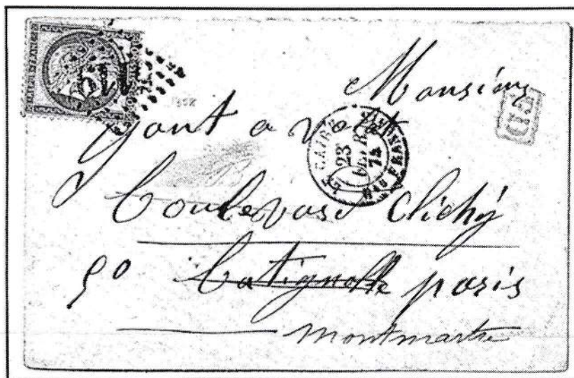
1874: Cairo, Egypt to Paris, France 80 Centimes Single Letter Rate

February 23, 1874 Posted at Cairo, Egypt