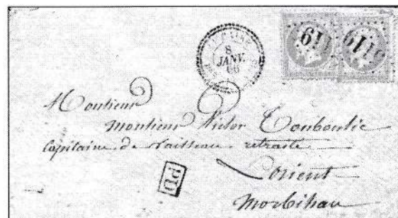
Earliest Known Letter from the French P.O. at Cairo