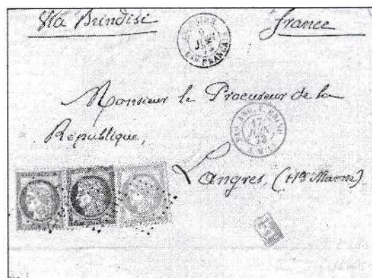
One of Two Known Letters from the French P.O. at Cairo Sent via Brindisi