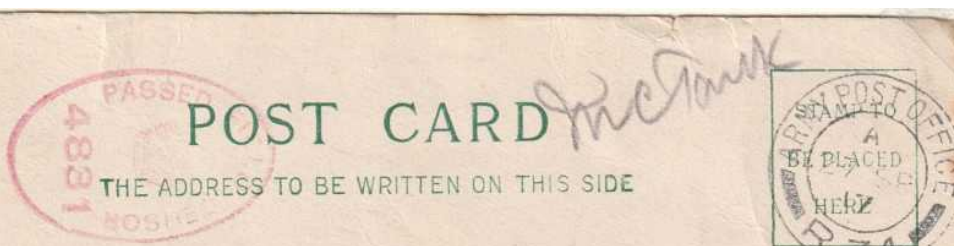
1917 Army Post Office R.34 cds to LONDON S.E with "1" added in manuscript - WWI censored

Dublin District Initials and Numbers , Winkelmann, August 2024, Irish Philately The Post Office in Ireland , Ferguson, 2016, p371, IAP Official documents from the Irish National Archives