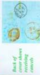
Back of cover shows receiving cutback