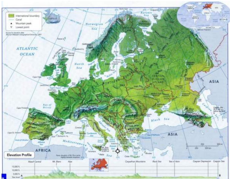
Ireland as part of Europe and the British Isles