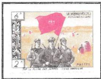
Neutralist, 1961 Armed Forces on the Plain of Jars - Xieng Khouang