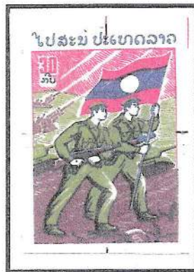
Pathet Lao, 1974 Proof with printer's guidelines Battle of Xieng Khouang